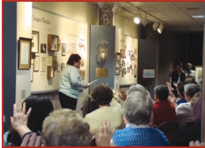
Saint Joseph College Alumnae's blessing of the “Last Candle” in the Seton Shrine Museum.